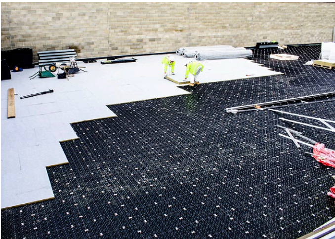
Rooftop pitch, London (UK)