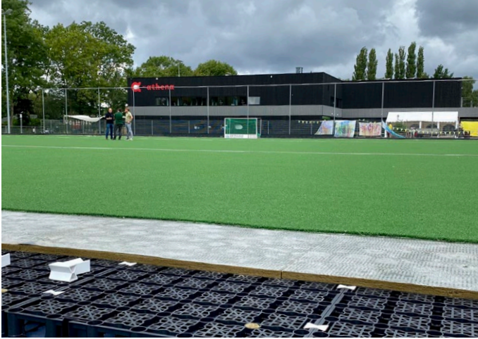
Hockey Club Athena, Amsterdam