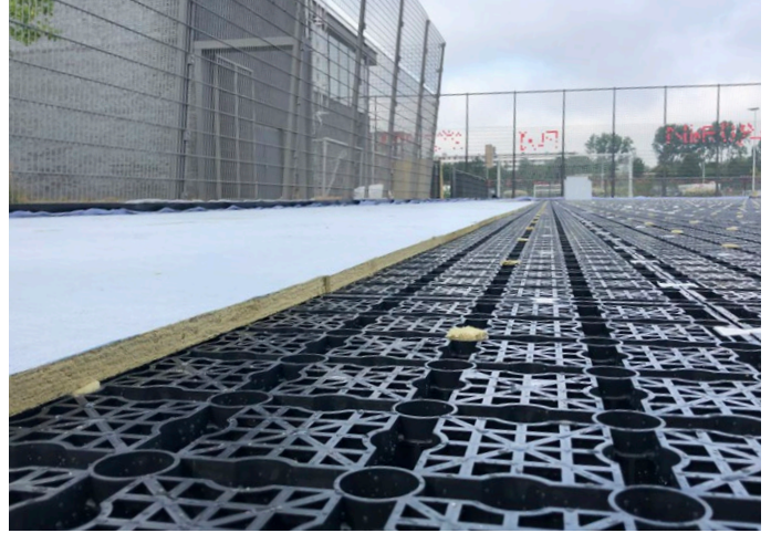
Football Club VVA Spartaan, Amsterdam