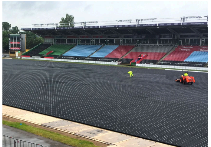
Temporary "Big Stadium Hockey" event (UK)